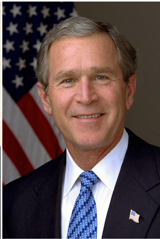
President George W. Bush