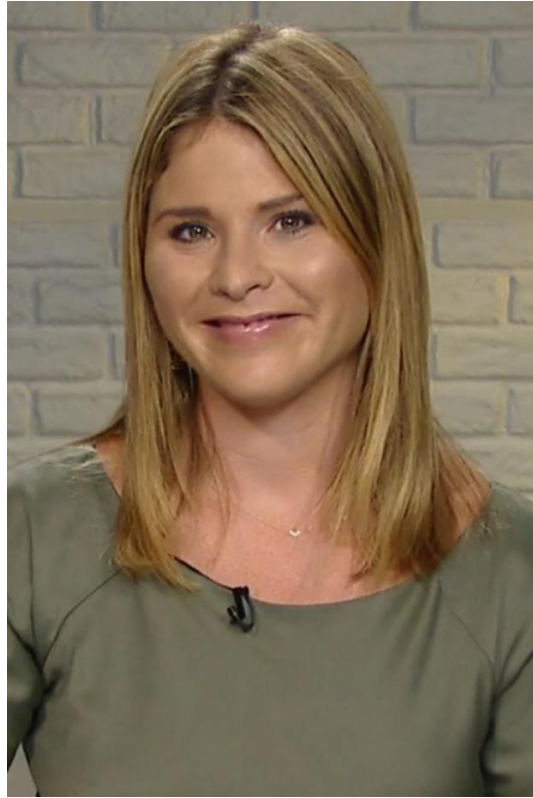
Jenna Bush Hager