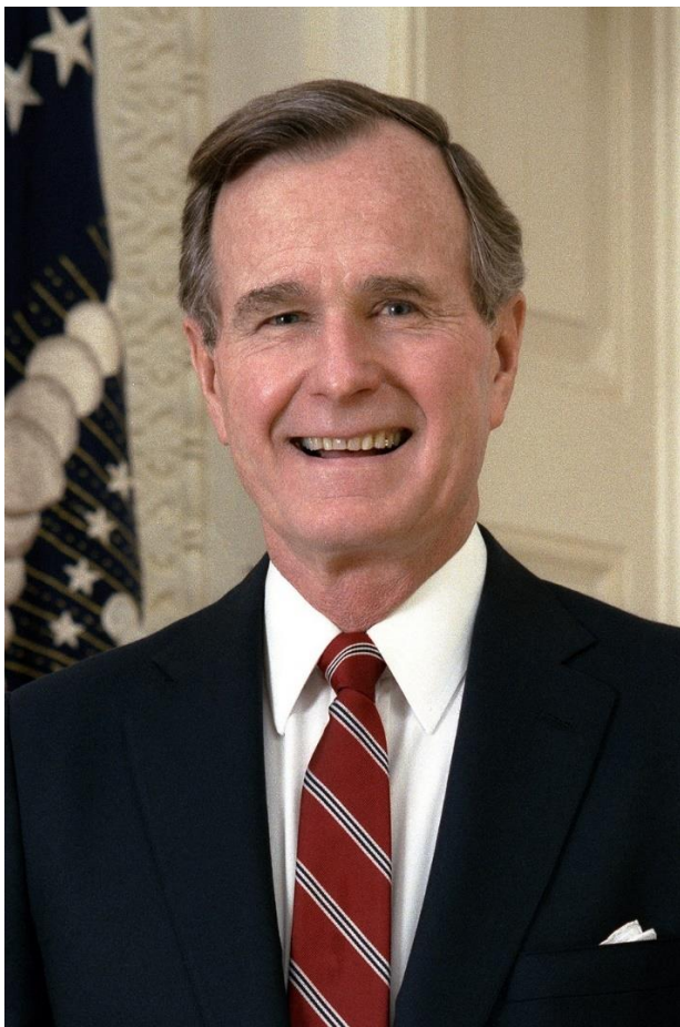
President George H. W. Bush

Here are photos of some of our more famous Bush cousins.