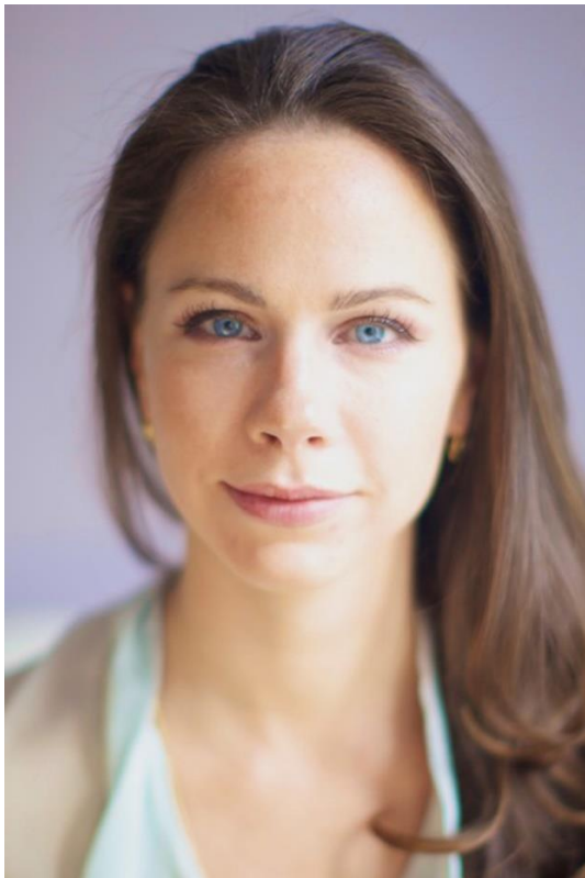
Barbara Pierce Bush